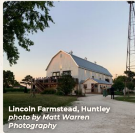
Lincoln Farmstead, Huntley