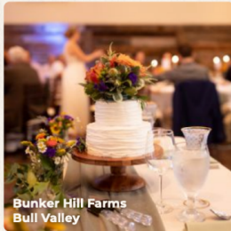
Bunker Hill Farms Bull Valley