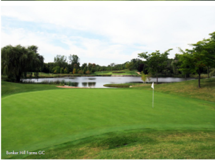
Bunker Hill Farms GC