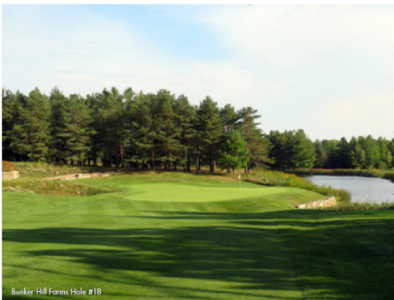
Bunker Hill Farms Hole #18